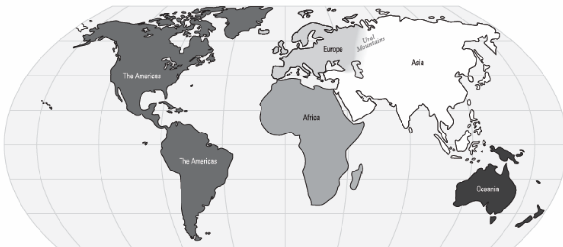
AP World History: World Regions — A Closer Look