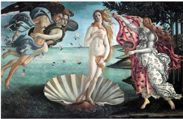
The Birth of Venus