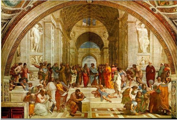
The School of Athens