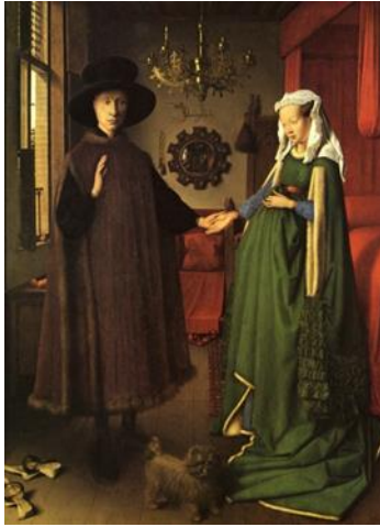
The Arnolfini Wedding