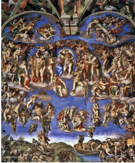
The Last Judgement