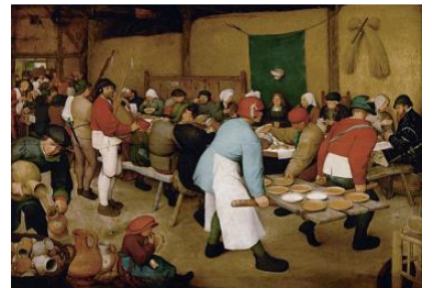
The Peasant Feast