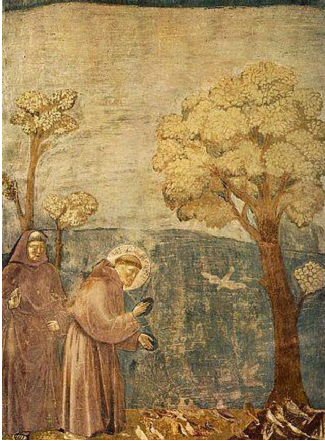
Saint Francis Preaching to the Birds, Giotto, 1300s