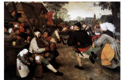
The Peasant Dance