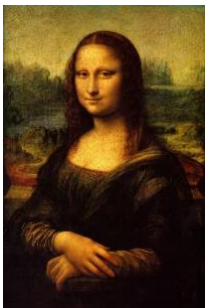
The Mona Lisa ←