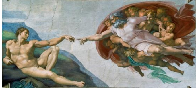
The Creation of Adam, Sistine Chapel