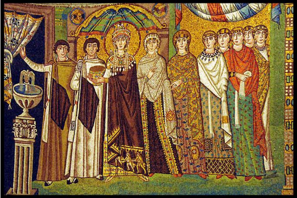
Empress Theodora and Her Court , dated 6 th century