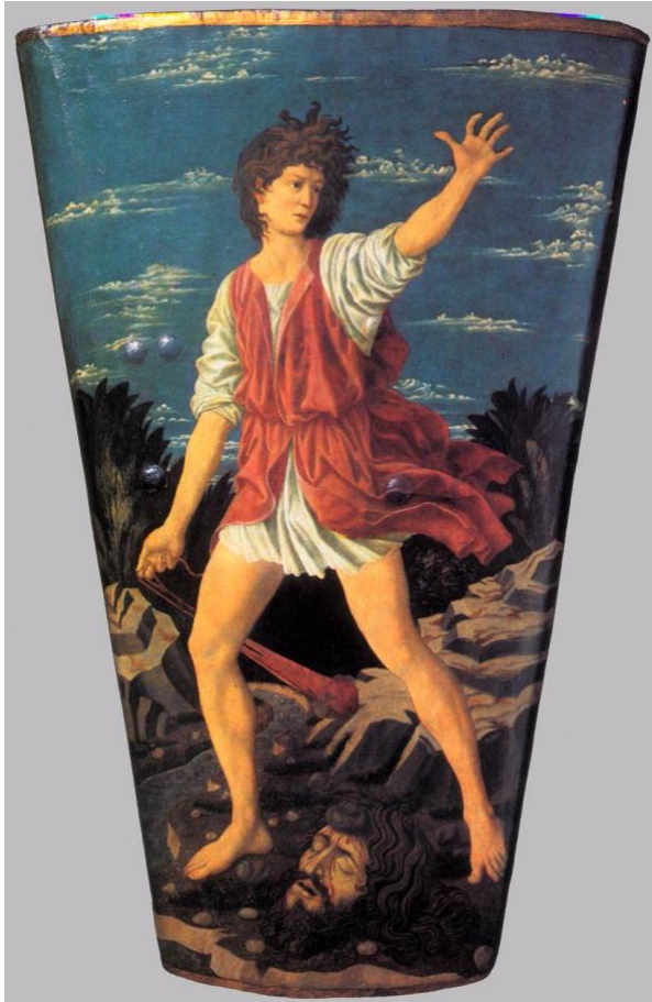
The Youthful David , Castagno, 1423-1457