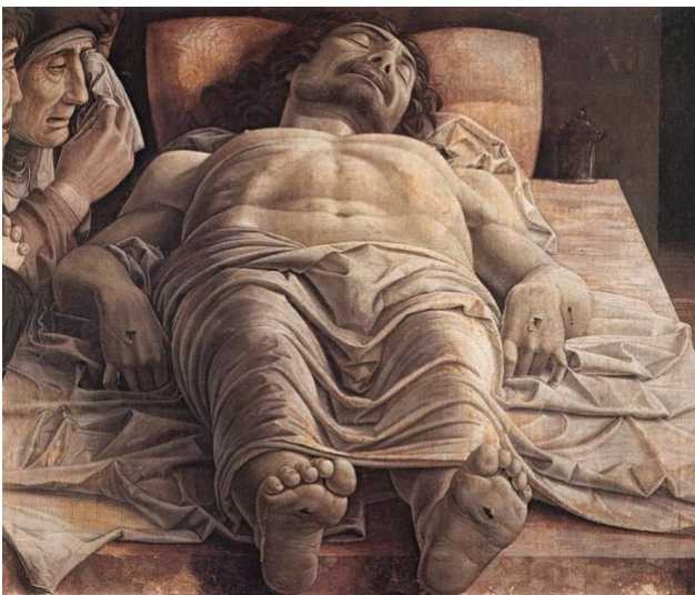
Lamentation over the Dead Christ