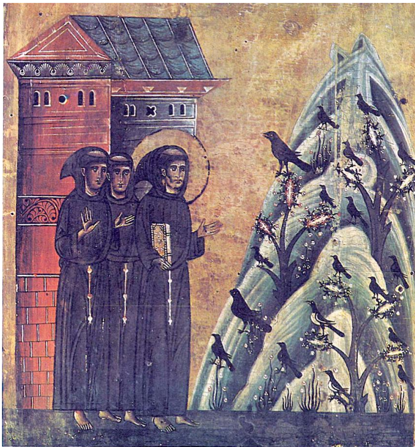
Saint Francis Preaching to the Birds , Bonaventura Berlinghieri, 1200s