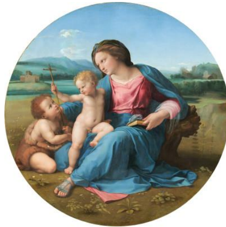
The Alba Madonna